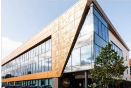
PUBLIC SERVICE HUB Ellesmere Port, England