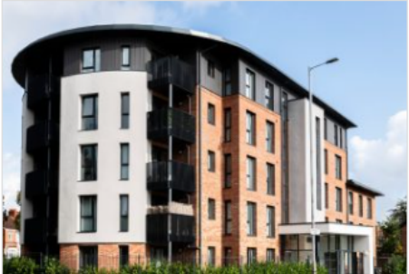
THE CURVE Manchester, England