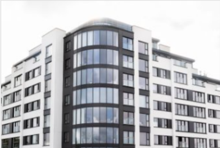
BROADWAY APARTMENTS Morecambe, England

K Systems' pipeline for steel frame Direct Fix jobs has increased by £3m since launch