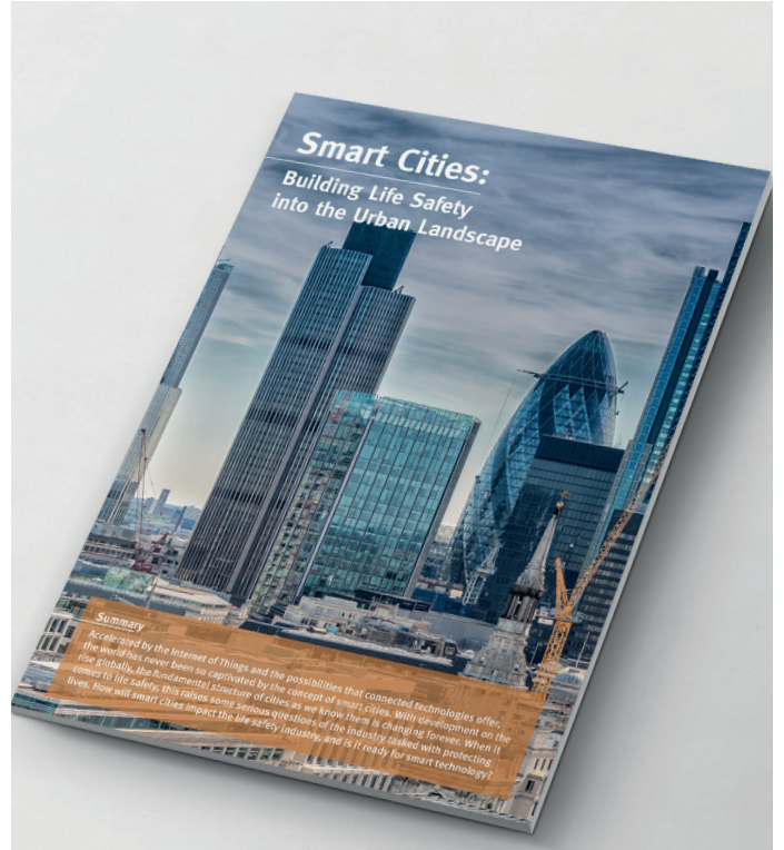
Hochiki Europe Smart Cities Report