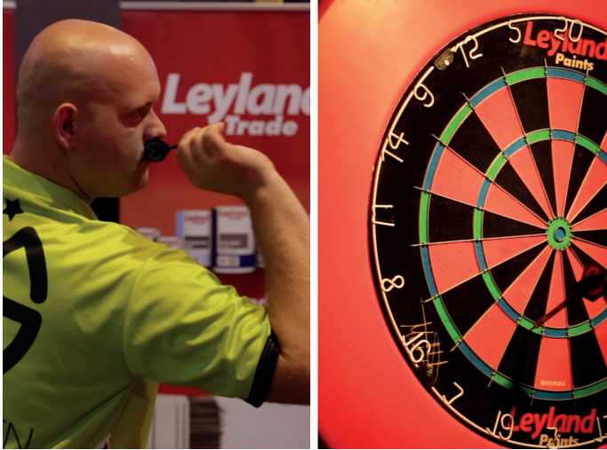
Leyland Trade Darts Competition