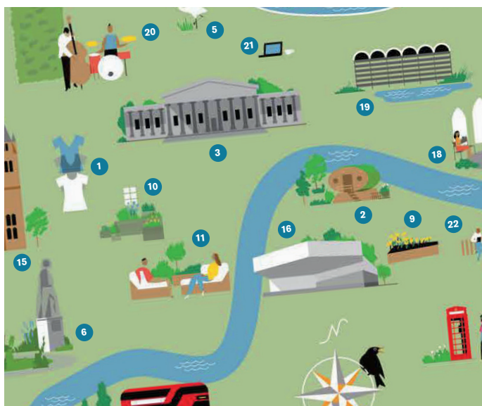
Engaging Content: Biophilic Guide to London for Interface