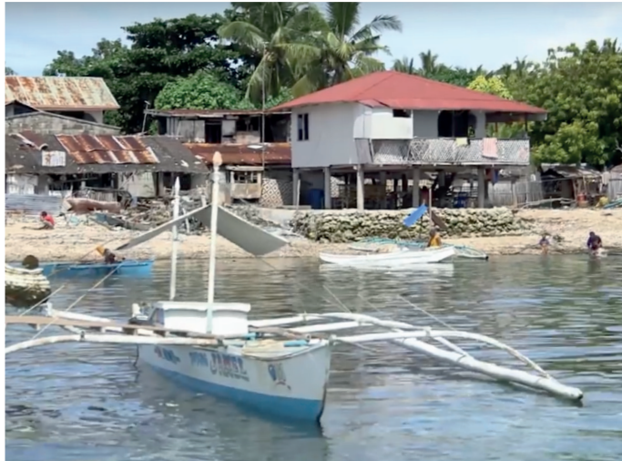
Interface and the Economist Films