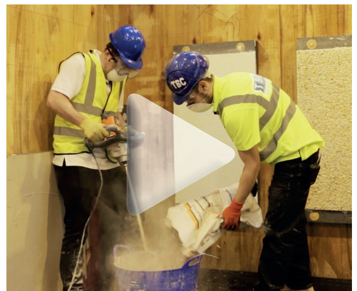
Engaging Content: Young Tradesperson of the Year for Jewson