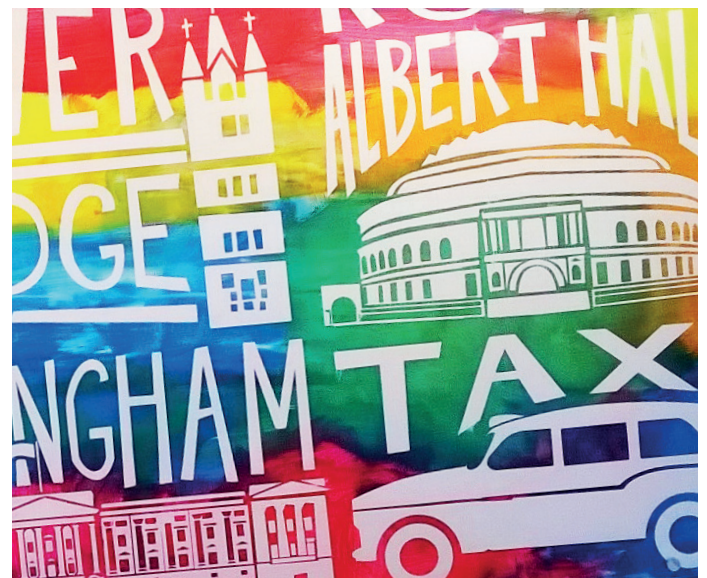
Creative Thinking: Clerkenwell Design Week for Johnstone's Trade