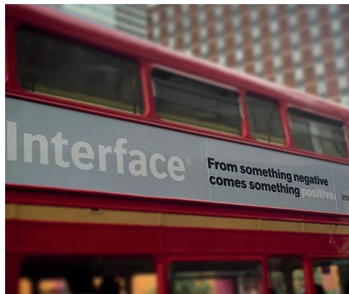
Creative Thinking: Biophilic Bus Tour for Interface