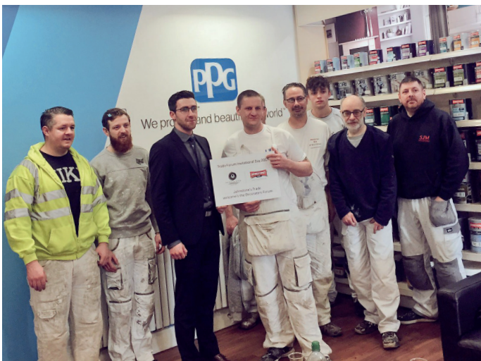
Johnstone's Trade Decorator's Forum All Access Day