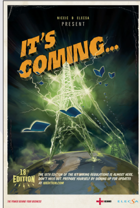
Stage I: Awareness