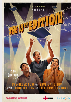
Stage II: Pre-orders