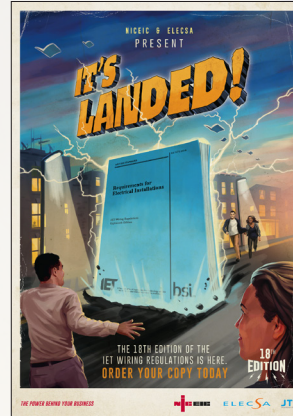
Stage III: Full Launch