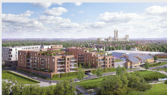
Kingsmead – 189 new homes in Canterbury