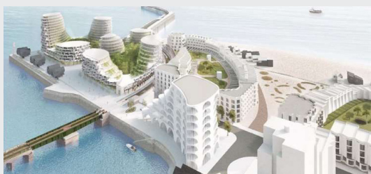
84 luxury apartments, of a potential 1000 unit masterplan of Folkestone Seafront on behalf of Folkestone Harbour and Seafront Development Company