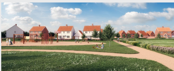
160 affordable new homes in Hailsham for Optivo